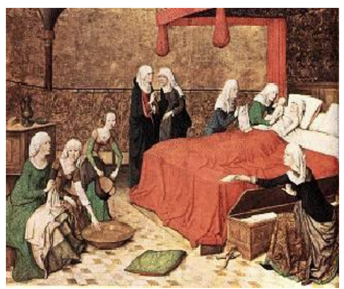
Figure 4- Diseases in the Middle Ages

Thus, it is relevant to address that the living and working conditions of the population were directly linked to their health situation, social, cultural and psychological factors that influence the occurrence of diseases and illnesses. Therefore, promotion, prevention, cure and rehabilitation were initial measures based on health education and actions used by the State aiming at improving the quality of life (Figure 4).