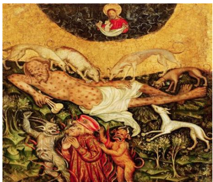
Figure 1- Painting the parable of the first Lazarus in the Bible, from stock photos.

The conceptions of health and illness began to develop from the Sumerian people as well as in ancient Egypt, where illness was seen and analyzed as a divine punishment, having a magical-religious conception resulting from the action of forces alien to the organism that they introduced by sin or curse. In addition, the health-disease process manifested itself in the field of arts (through works, culture (through tables, teas, preparations, rituals of magic), and science already in the most current centuries (Figure 1).<sup>4</sup>