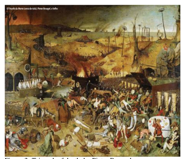
Figure 3- Triumph of death, by Pieter Bruegel.

Among the theories that explain the health-disease process, in Brazil, at the end of the 19th century, the primitivist conception attributed to the disease a situation of single cause and/or supernatural cause, often associated with a punishment from heaven for the sick. As a concrete cause of disease generation, it was also accepted the belief in the theory of miasmas, in which disease is associated to contact, sense of touch, atmospheric conditions (Figure 3).