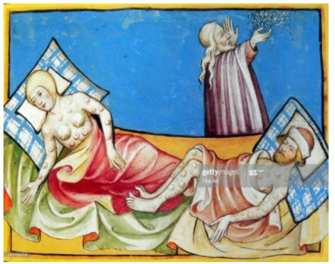
Figure 5- Illustration of individuals affected by bubonic plague.