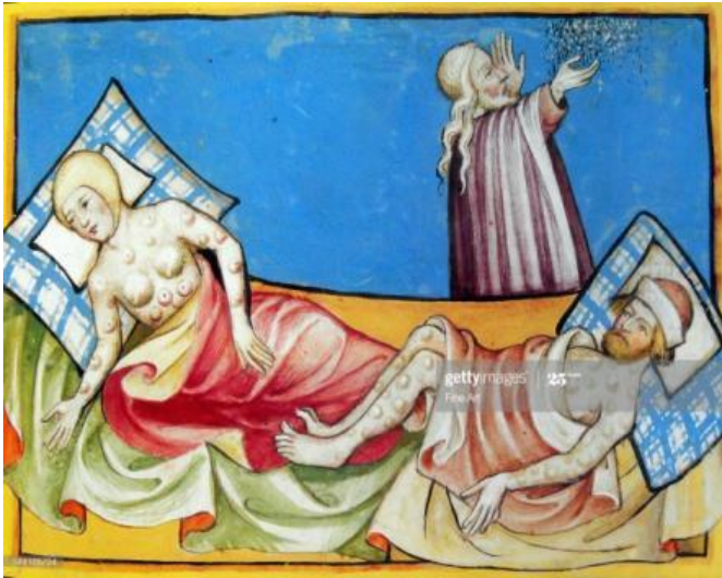
Figure 5- Illustration of individuals affected by bubonic plague.