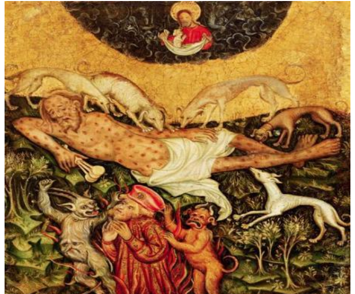
Figure 1- Painting the parable of the first Lazarus in the Bible, from stock photos.

The conceptions of health and illness began to develop from the Sumerian people as well as in ancient Egypt, where illness was seen and analyzed as a divine punishment, having a magical-religious conception resulting from the action of forces alien to the organism that they introduced by sin or curse. In addition, the health-disease process manifested itself in the field of arts (through works, culture (through tables, teas, preparations, rituals of magic), and science already in the most current centuries (Figure 1). 4