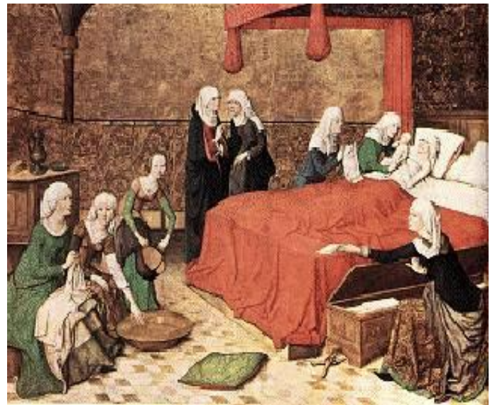
Figure 4- Diseases in the Middle Ages

Thus, it is relevant to address that the living and working conditions of the population were directly linked to their health situation, social, cultural and psychological factors that influence the occurrence of diseases and illnesses. Therefore, promotion, prevention, cure and rehabilitation were initial measures based on health education and actions used by the State aiming at improving the quality of life (Figure 4). 8