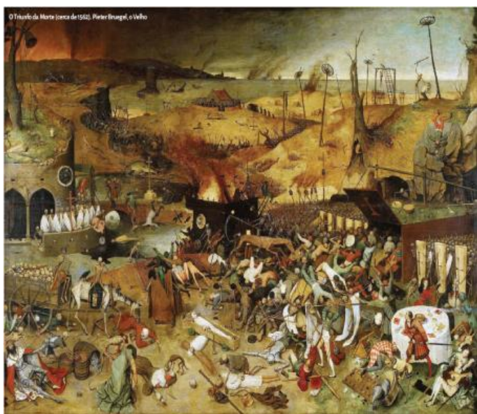
Figure 3- Triumph of death, by Pieter Bruegel.

Among the theories that explain the health-disease process, in Brazil, at the end of the 19th century, the primitivist conception attributed to the disease a situation of single cause and/or supernatural cause, often associated with a punishment from heaven for the sick. As a concrete cause of disease generation, it was also accepted the belief in the theory of miasmas, in which disease is associated to contact, sense of touch, atmospheric conditions (Figure 3).